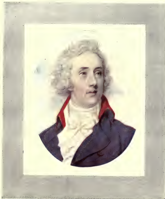
THE RT. HON. WILLIAM PITT BY HORACE HONE

FROM THE COLLECTION OF LADY MARIA PONSONBY